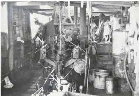
Upper left. Kahlenberg engine powering the Bob Richard on Lake Michigan. The net lifter is powered by the engine vacuum. Upper right. "Setting back" nets from a wooden box. The gill net is attached to an anchor. As the boat moves away, the net is pulled out of the back of the boat and falls to the bottom of the lake. The net must stay taut, or fish will see it.