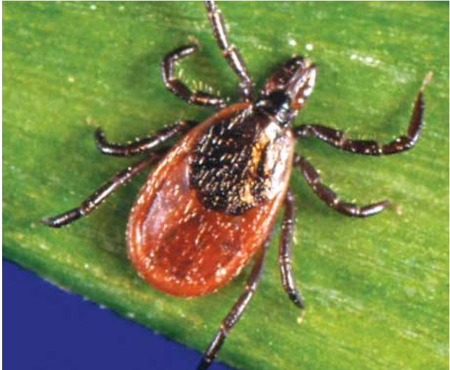
Female black-legged (deer) tick (Ixodes scapularis) transmits Lyme disease.

Spring arrived like the long-awaited cavalry to our Covid-besieged, locked-down fortress homes. Finally, warmer weather, sunshine and the season's first flowers. At last, we began to have hope. Then we heard about the next of our trials: the worst tick season in probably 20 years.