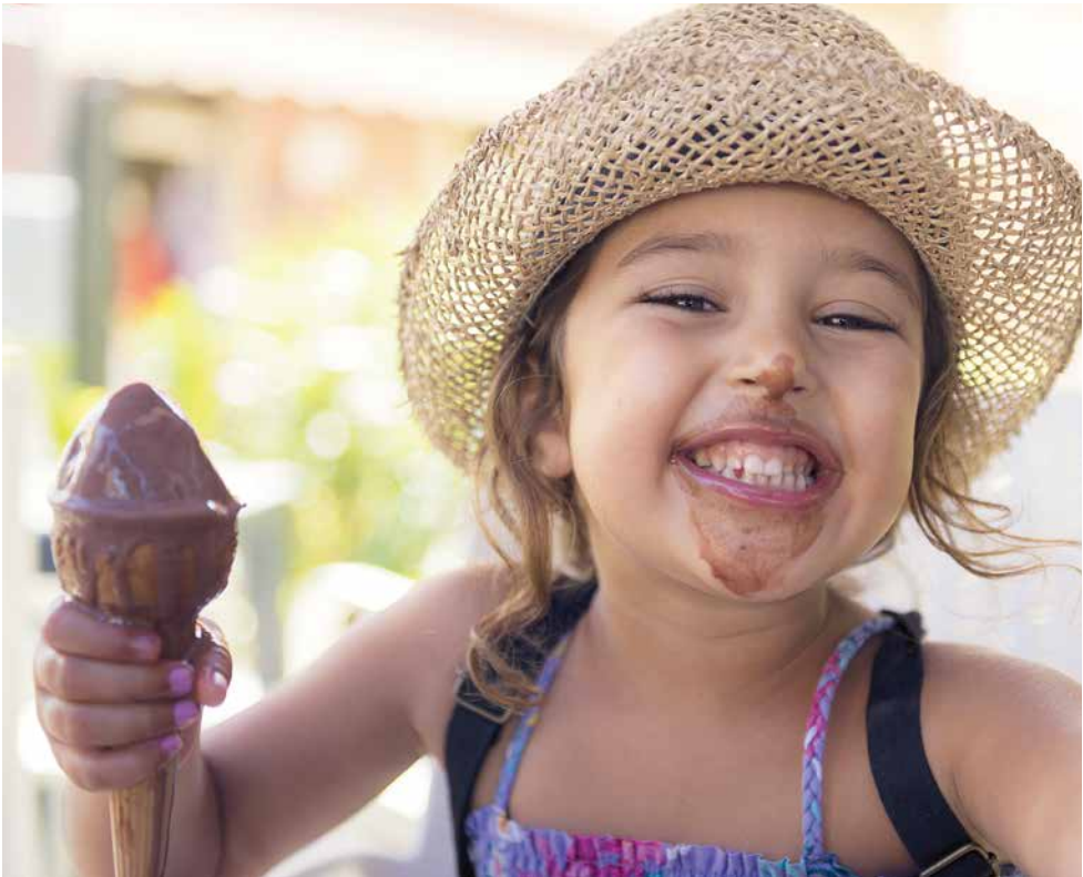
After a hard day of play, there’s nothing like an ice cream.