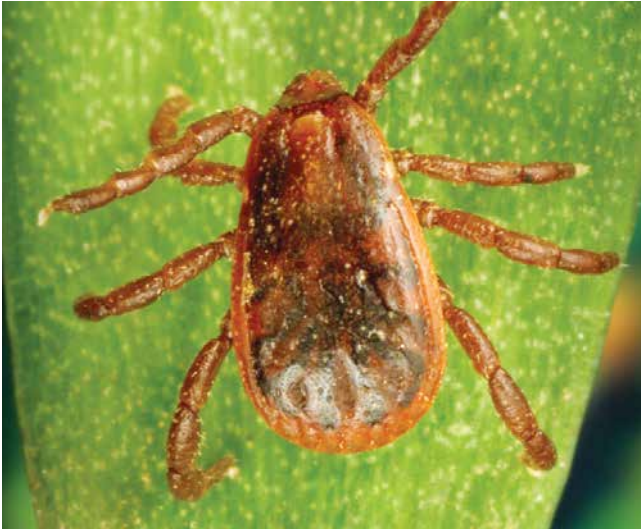
Male brown dog tick.