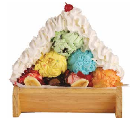
“Super Dooper Pig’s Dinner” is available at Ludington’s House of Flavors.

of ice cream in flavors such as Blackberry Dark Chocolate Chunk, Caramel Caribou and Chocolate Chip Cookie Dough were lined up in front of me and waiting to be scooped. Forty flavors, in all. Sitting on a bench outside, under the hot sun, I found it didn’t take long before the ice cream dripped down the side of the cone and onto my fingers. I felt like a little kid again and loved it. The ice cream itself was smooth and sweet with the waffle cone adding a little extra sweetness. While the ice cream is definitely worth trying, the price was a little more than I expected at $4 for a single dip plus an extra buck for the waffle cone, but then this isn’t the 1960s ... when my ice cream cone cost less than a dollar. Jones Homemade Ice Cream, Baldwin On to Jones Homemade Ice Cream at 858