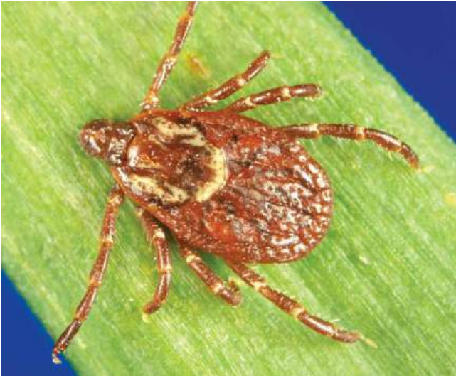
Female American dog tick can carry diseases such as Rocky Mountain Spotted Fever and tularemia.

This is part one of our two-part article about ticks, the disease-carrying insects we love to hate. In part one, we look at what they are, where they hang out, and how to tick-proof your surroundings and YOU. Look for part two in our July 14 issue. In it, we'll look at how to do a tick check and when, and the best way to remove them once they've attached themselves to your skin.