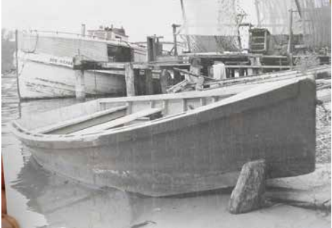
Bjorkquist Bros. dock on the north side of the Manistee River where the Bob Richard was tied up. They had an icehouse, a smokehouse and a building where they fixed nets.

"I couldn't see a future in (fishing); I lost money at fishing," he continued. "I'd get